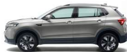
Steel Grey New