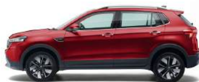
Cherry Red New