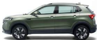
Shimla Green New