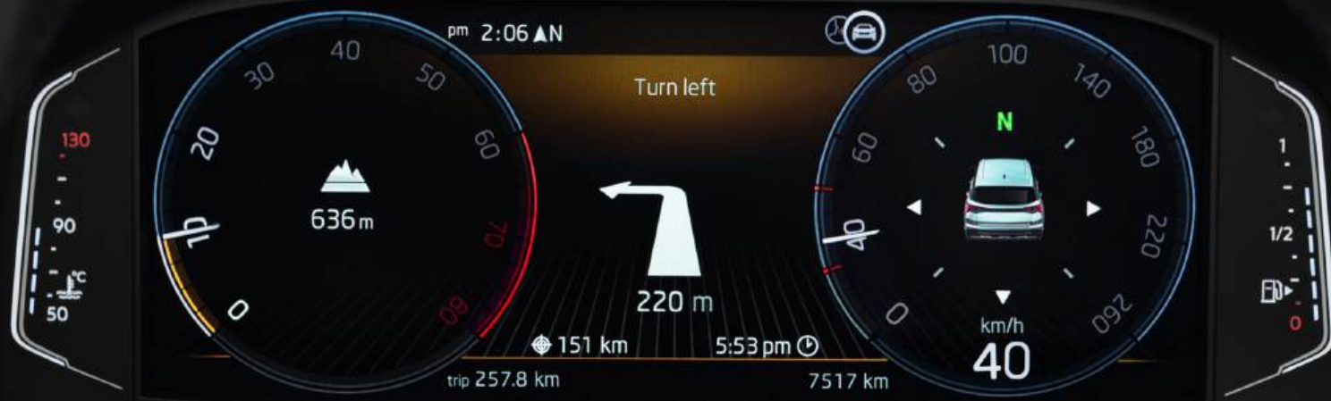
26.03 cm Virtual Cockpit with turn-by-turn navigation