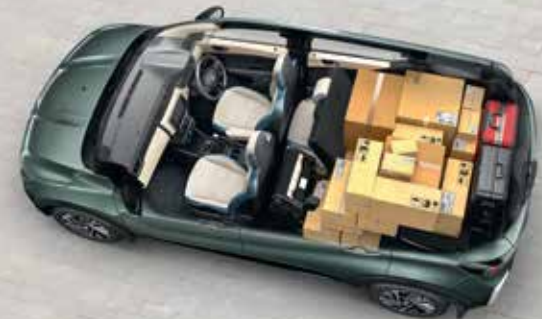
2-Seat configuration provides maximum cargo room for your business needs.