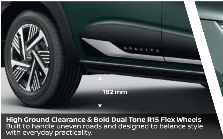
High Ground Clearance & Bold Dual Tone R15 Flex Wheels Built to handle uneven roads and designed to balance style with everyday practicality.

GRAVITE's stance, ground clearance, striking proportions as well as design give it an unmistakable road presence, no matter the geography it's driven to.