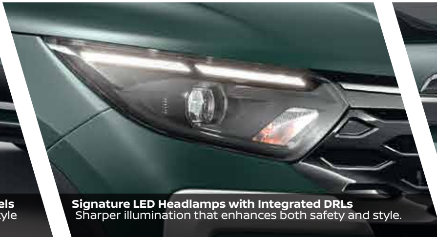
Signature LED Headlamps with Integrated DRLs Sharper illumination that enhances both safety and style.