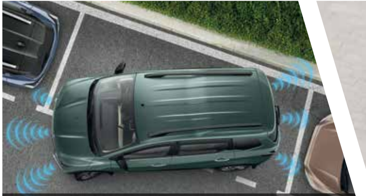
Front & Rear Parking Sensors Navigate confidently and with ease in tight spaces.