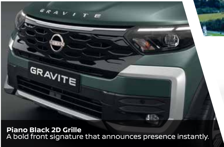
Piano Black 2D Grille A bold front signature that announces presence instantly.

GRAVITE's stance, ground clearance, striking proportions as well as design give it an unmistakable road presence, no matter the geography it's driven to.