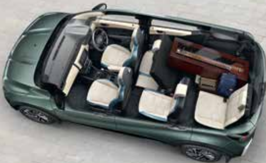
4-Seat smart configuration made for bags and belongings.