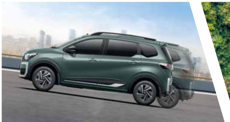
Hill Start Assist (HSA) Enjoy stress-free starts and confident control on inclines and flyovers.

Safety is at the core of GRAVITE. A combination of 30+ standard active and passive safety features, including 6 Airbags, ESC, TCS, HSA, ABS, EBD and more, protects everyone on board.