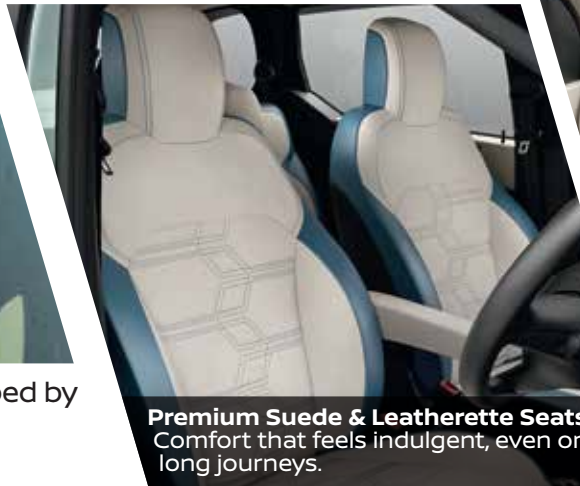
Premium Suede & Leatherette Seats Comfort that feels indulgent, even on long journeys.

The GRAVITE sports interiors that feel and look refined. Shaped by thoughtful craftsmanship & tactile finishes, daily drives feel elevated as materials, textures & lighting come together like functional art.