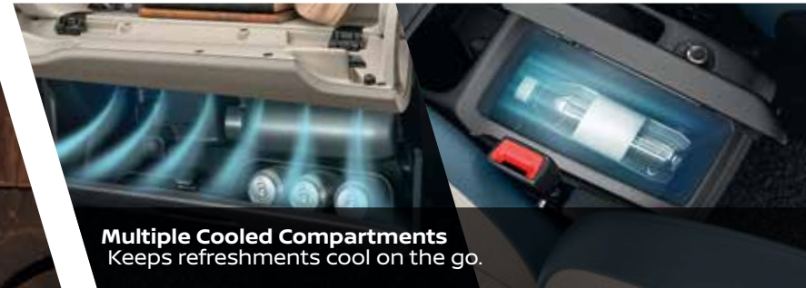
Multiple Cooled Compartments Keeps refreshments cool on the go.

GRAVITE is designed for evolving plans and shared journeys. Spacious seating, smart comfort features and thoughtful storage ensure the cabin adapts effortlessly, whether it's a daily commute, a family outing or a long highway drive.