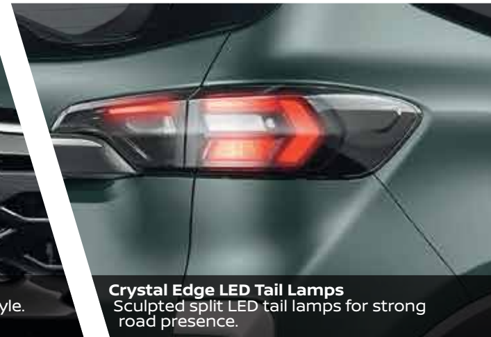
Crystal Edge LED Tail Lamps Sculpted split LED tail lamps for strong road presence.