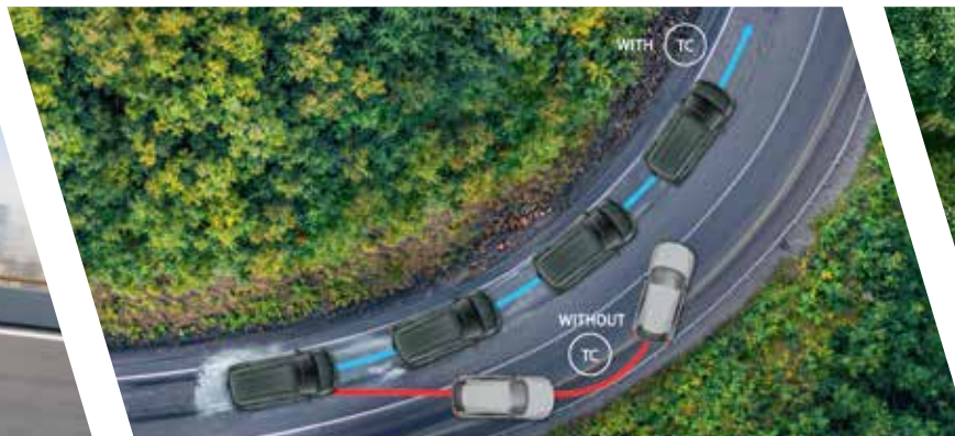
Traction Control System (TCS) Supports stable driving across changing road conditions.