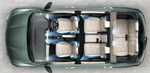
Tropicalised AC with 3-Row Vents Comfort for everyone, front to back.