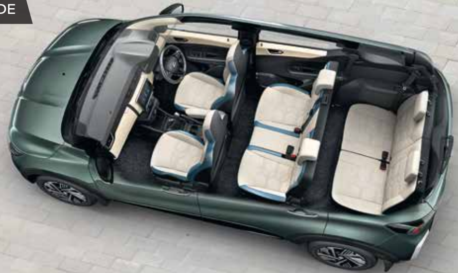
7-Seat configuration for comfortable long journeys.