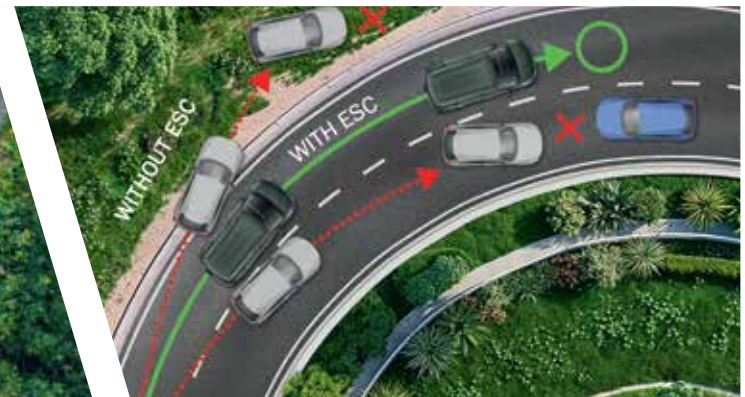
Electronic Stability Control (ESC) Maintain vehicle control during sudden maneuvers, cornering, or on slippery surfaces.