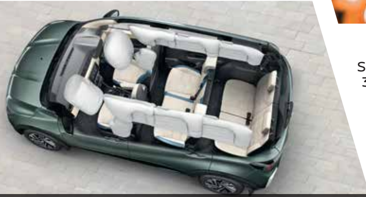
6 Airbags (Standard) All-around protection for everyone who journeys with you.

Safety is at the core of GRAVITE. A combination of 30+ standard active and passive safety features, including 6 Airbags, ESC, TCS, HSA, ABS, EBD and more, protects everyone on board.