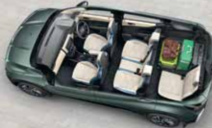
6-Seat configuration built for trips with extra gear.