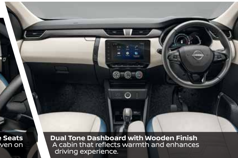
Dual Tone Dashboard with Wooden Finish A cabin that reflects warmth and enhances driving experience.