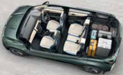
5-Seat configuration that balances passenger comfort with 625L boot space.