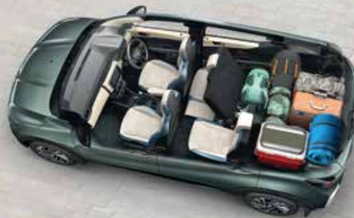
3-Seat configuration for adventures that need more room than seats.