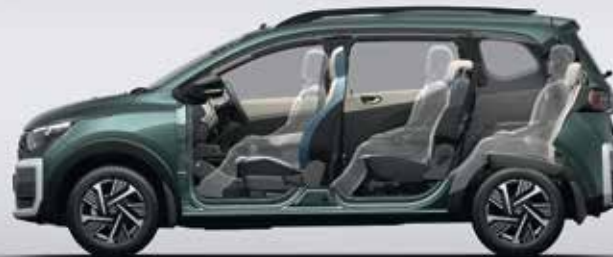
Generous Knee Room & Head Room (2 nd & 3 rd Row) Roominess that keeps long journeys relaxed.