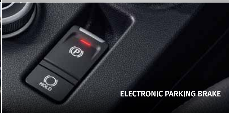
ELECTRONIC PARKING BRAKE