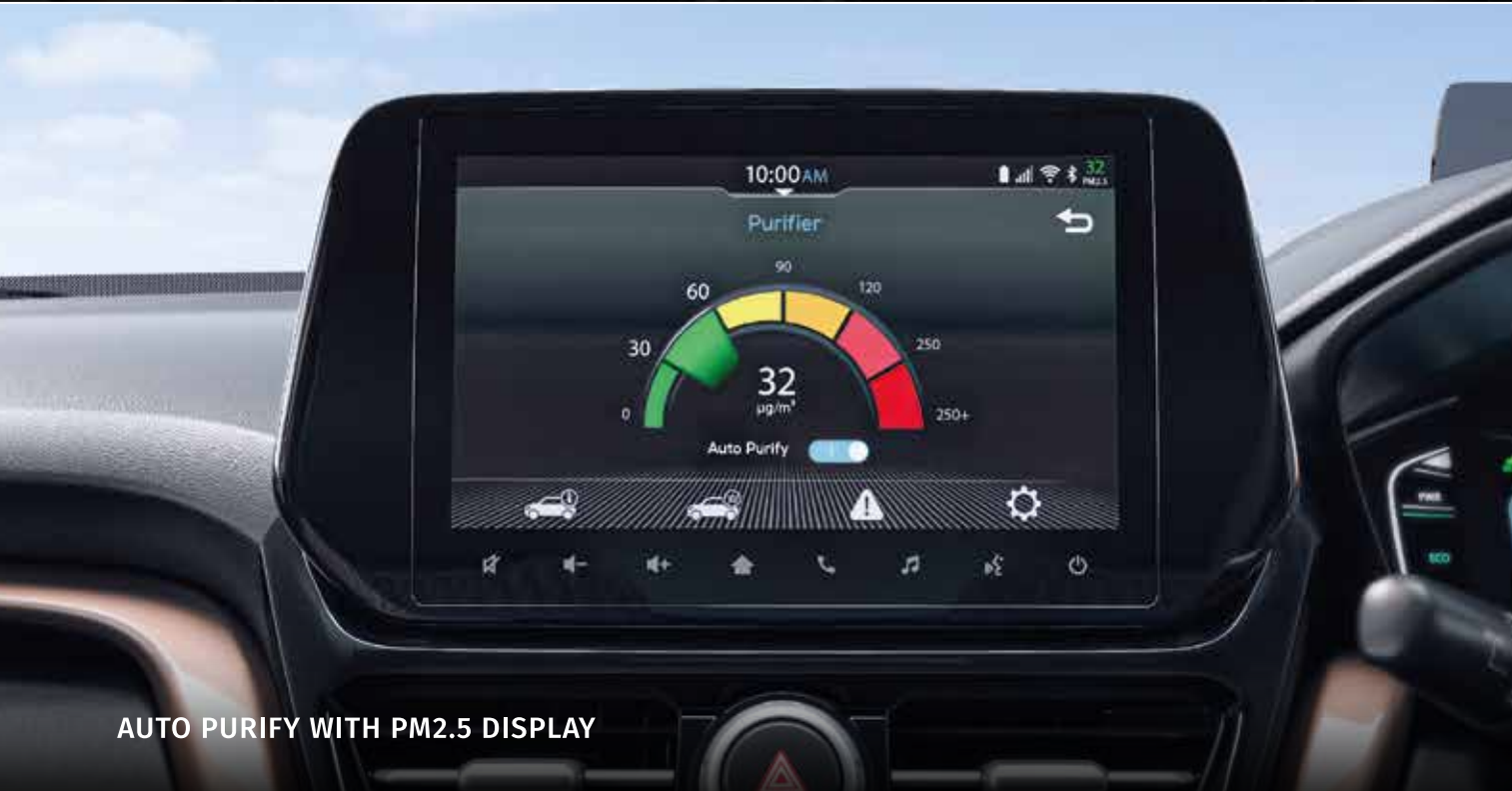
AUTO PURIFY WITH PM2.5 DISPLAY