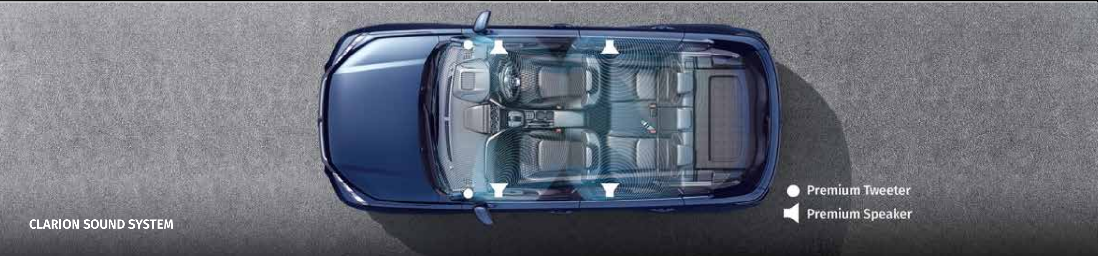
CLARION SOUND SYSTEM