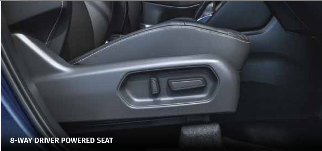
8-WAY DRIVER POWERED SEAT