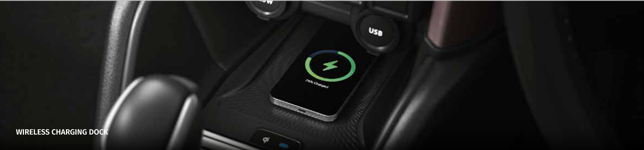
WIRELESS CHARGING DOCK