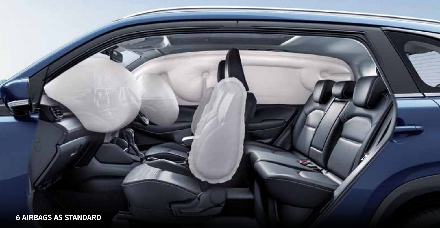
6 AIRBAGS AS STANDARD