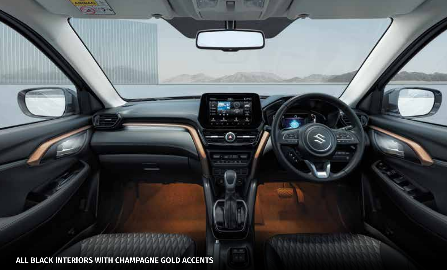
ALL BLACK INTERIORS WITH CHAMPAGNE GOLD ACCENTS