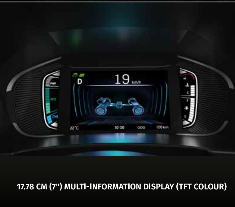
17.8 CM (7") MULTI-INFORMATION DISPLAY (TFT COLOUR)