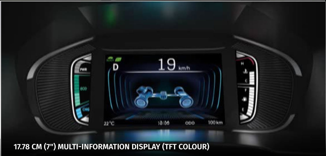
17.78 CM (7") MULTI-INFORMATION DISPLAY (TFT COLOUR)