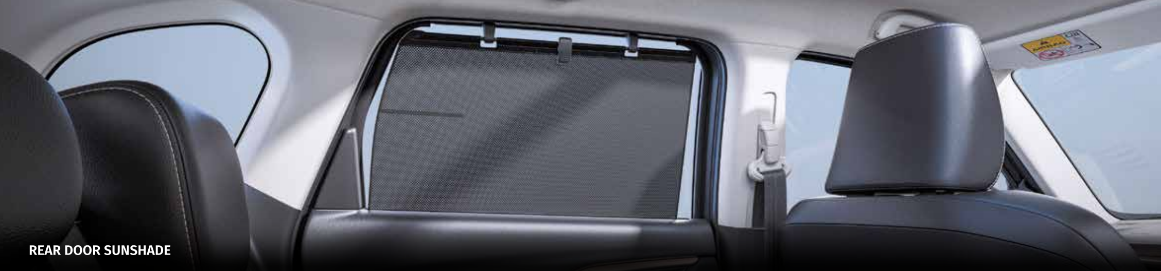
REAR DOOR SUNSHADE